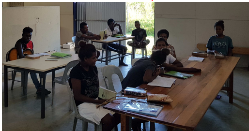
created purpose A B C D