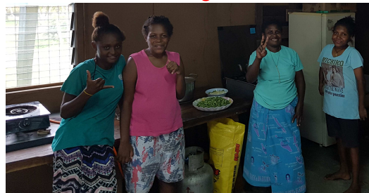
created purpose A B C D