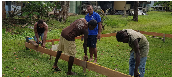
created purpose A B C D