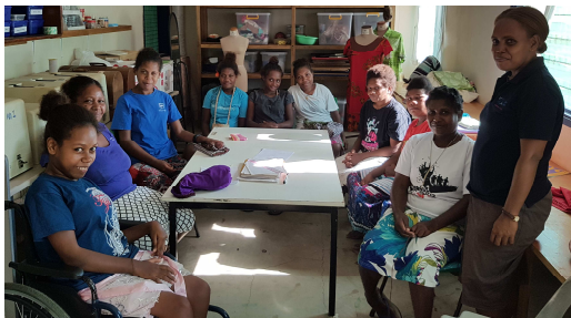
created purpose A B C D