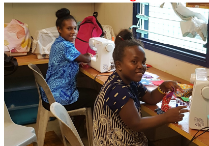
created purpose A B C D