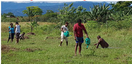
created purpose A B C D