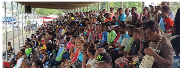
created purpose A B C D